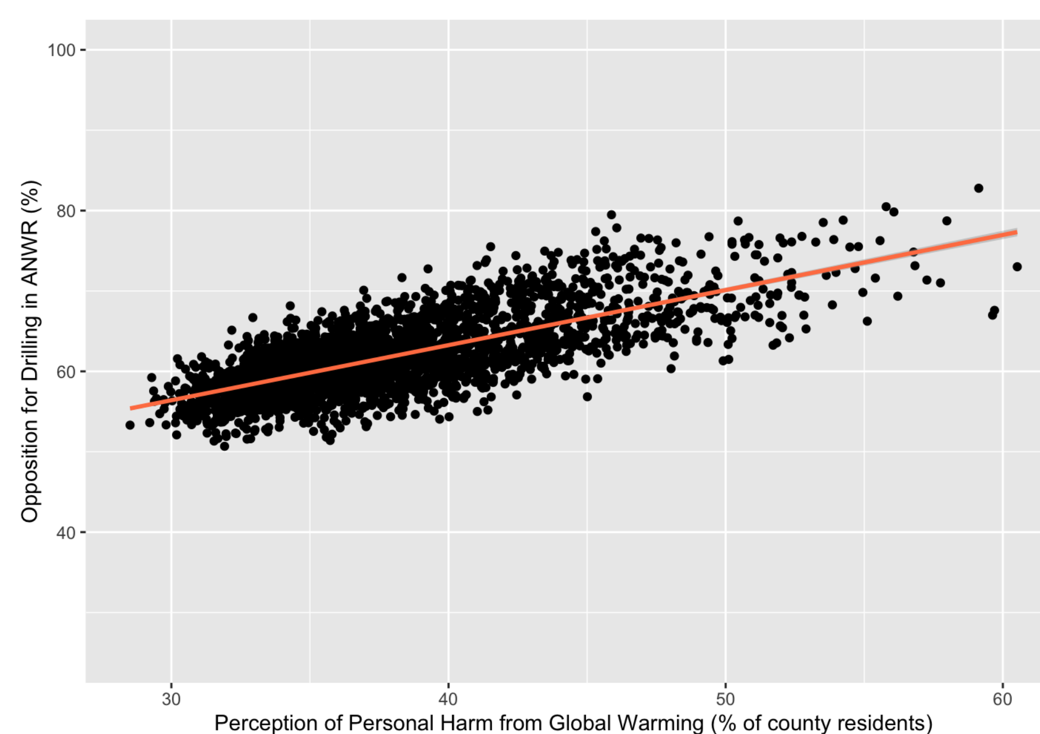
Figure 1: Relationship between Perception of Personal Harm from Global Warming and Opposition for Drilling in the ANWR